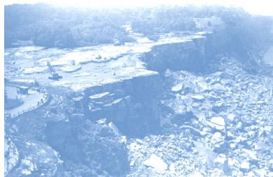
Niagara Falls without water in 1969. The water was diverted so that engineers could strengthen certain areas and slow erosion.

In our March/April 2016 issue of Matters That Matter , we told you that the Americans will staunch the flow of water going over Niagara Falls on their side of the border in 2019. The reason for the staunching of the falls, will be to do research on erosion and to fix the